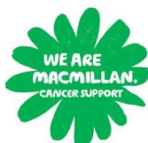
TABLE TOP SALE

Thank you to everyone who supported our charity event for Macmillan. We raised £435.30 which will be donated to Macmillan Cancer Support.